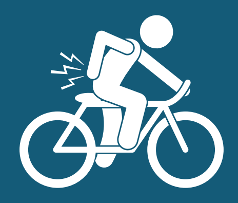
83 million Americans indicate that pain affects basic functioning in their everyday lives.<sup>6</sup>