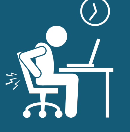
Workers lose an average of 4.6 hours per week of productive time due to a pain condition.<sup>2</sup>